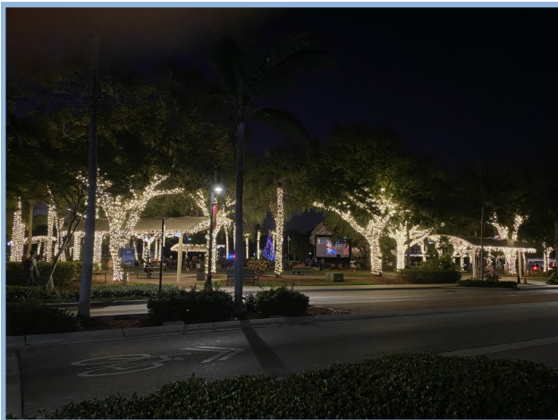
Above: Riverside Park is lit up for a Holiday Movies in the Park showing of The Polar Express.