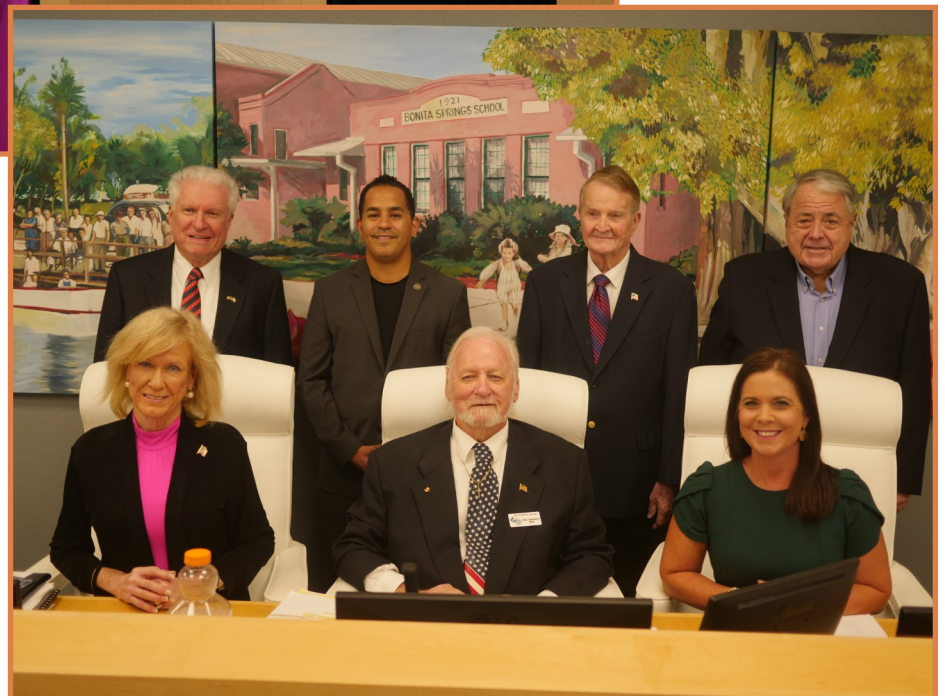
Right: The newest City Council is pictured at their first City Council meeting together on December 7th.