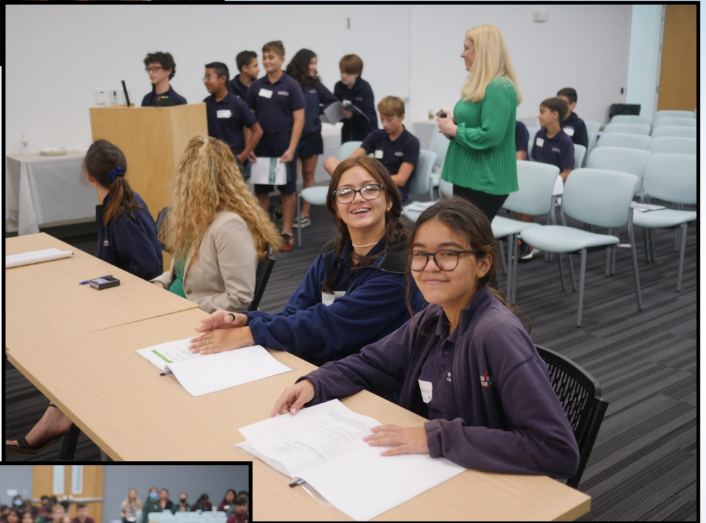
RIGHT: Students from Bonita Springs Charter School participate in a mock City Council Meeting on April 8, 2022.