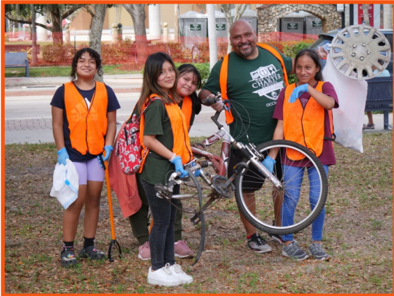
Residents pitch in as part of the City Wide Clean Up on Saturday, February 19th.