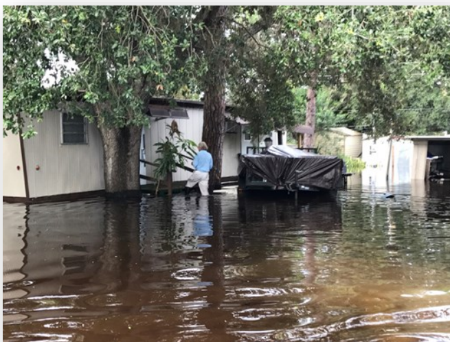
City Staff went door-to-door in low lying areas to make sure residents had resource information.