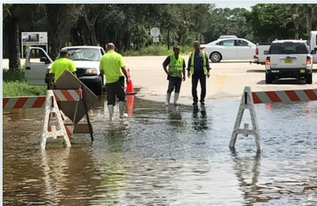
Public Works Department setting out road closure signage.