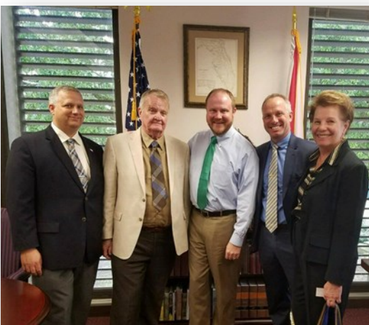
City Council members meeting with Representative Matt Caldwell in Tallahassee for the Legislative Session.