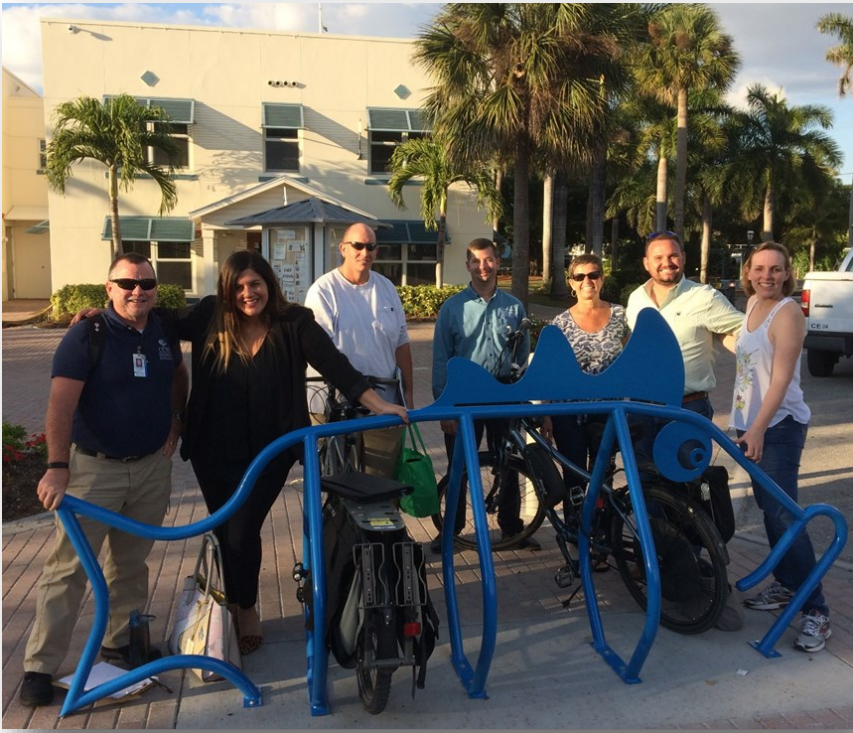
The Bicycle Pedestrian Committee standing near a fish inspired bike rack that has been installed near the Liles Hotel in downtown Bonita Springs