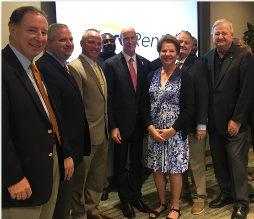
Council attended Governor Scott's jobs announcement at HERC Rentals