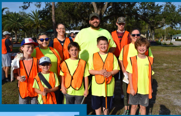
Top left: Volunteers sign up for City Wide Clean up.