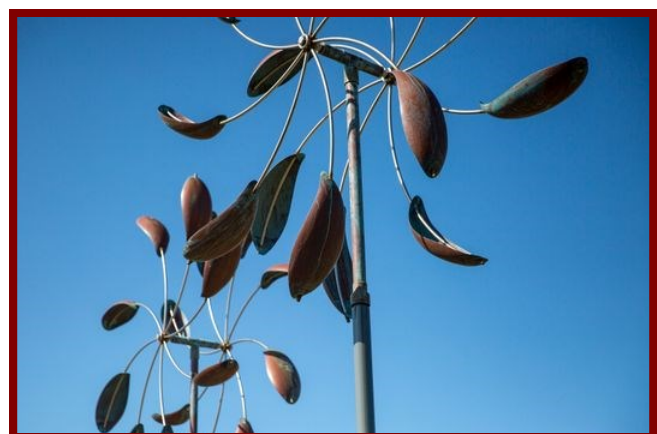
Photo to the right: A picture of the revolving Spinners metal art sculptures, by Lyman Whitaker, placed in River Park by the Art in Public Places Board. The slightest gust of wind twists and turns the metal sculptures. What a sight to see!

Have you seen the art in River Park lately? The Bonita Springs Art in Public Places Board is doing a wonderful job bringing new and exciting art and culture to our revitalized downtown area and Old 41. The City is partnering with the University of Montevallo in Alabama, a school with a strong art program, to display student art work in the coming months in River Park. Watch for it.