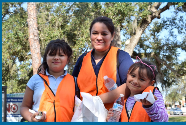
Below: Volunteers enjoy a well deserved lunch after the clean-up, provided by Buffalo Chips.

Enthusiastic volunteers gathered in downtown Bonita Springs to participate in the "Keep the Beautiful in Bonita Springs City Wide Clean Up". Helpers did a wonderful job and we are grateful to them for their donations of effort and time!