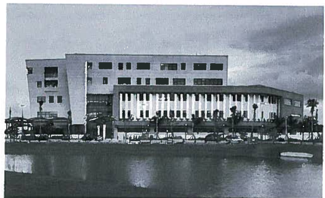
St. Johns Public Safety Complex - St. Johns, Florida

Planning and Design of Municipal Facilities